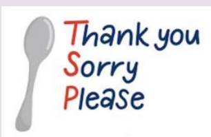
Table Talks - Can a dog be kind?

We continue finding out about Catholic Social Teaching, and our focus this month is on Solidarity. This tells us that we must show care to everyone and not walk on by, 'blind' to the needs of others. We are connected to people all over the world. "All of you are one in Jesus Christ." Galatians 3:28